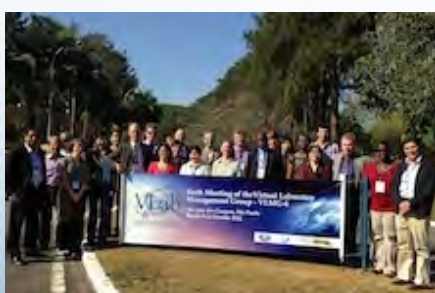
The VLab Management Group meets online three times a year. Each online meeting is held twice, with one session for the Western hemisphere and another for the Eastern hemisphere. Although much VLab business is carried out via online meetings, the VLab organises a face-to-face meeting every other year in one of the member countries. This photo shows VLab members participating in the sixth VLab Management Group Meeting held in São José dos Campos, Brazil, in October 2012.