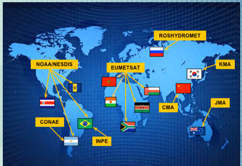
VLab links between Centers of Excellence (represented by their national flag) and their supporting satellite operators highlighted in yellow (status: December 2012).

The Centres of Excellence (CoEs), working closely with one or more of the satellite operators and often co-located with WMO Regional Training Centres, are established in all WMO Regions to meet user needs for increased skills and knowledge in using satellite data within their Region.